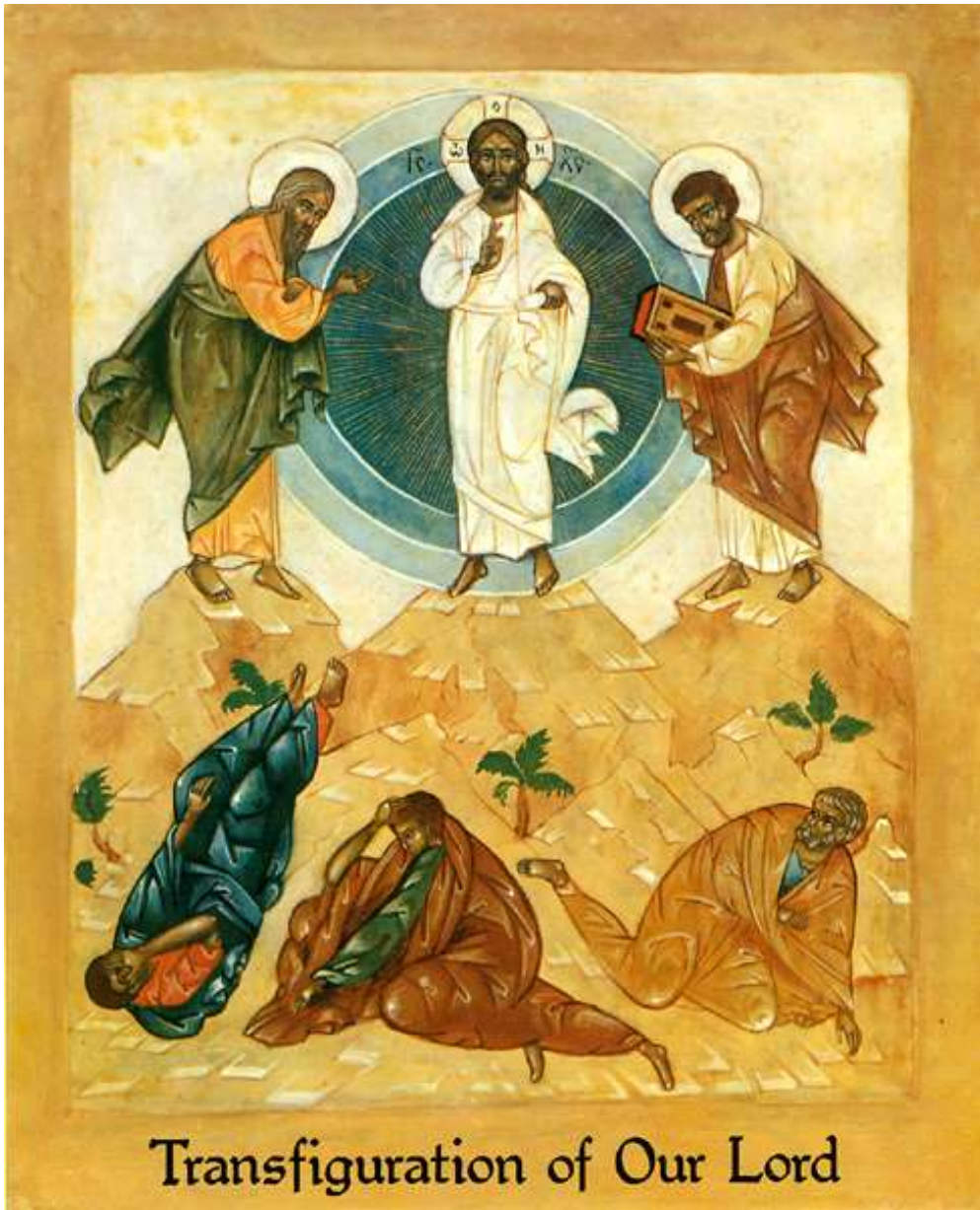
Transfiguration of Our Lord